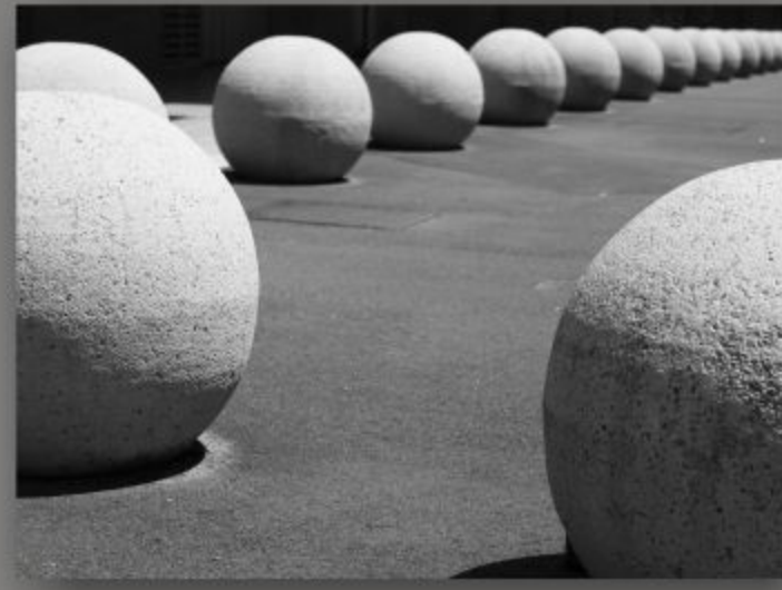
PROPOSED 30" DIAMETER SPHERICAL BOLLARDS AT SIDEWALK