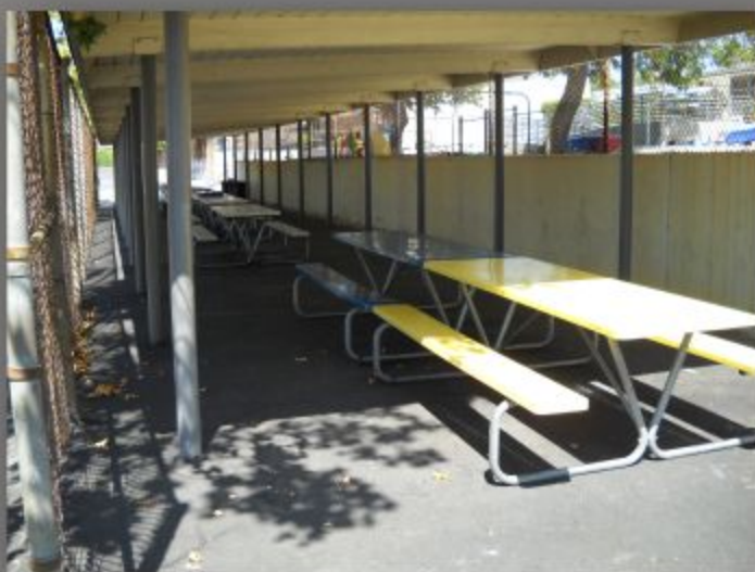
EXISTING SHADE STRUCTURE WITHOUT LIGHTING