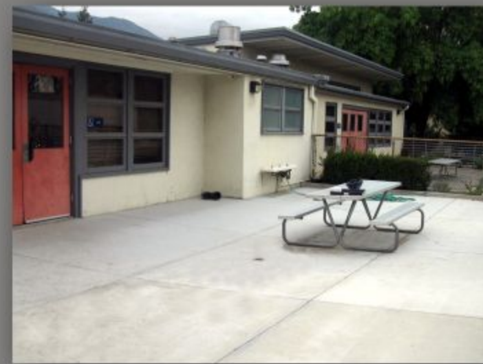
PROPOSED CONCRETE PATIO AND ADA THRESHOLD