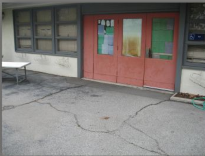
EXISTING DAMAGED PAVING AND THRESHOLD AT PATIOS