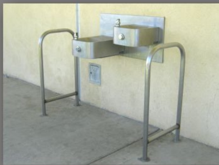
PROPOSED ADA COMPLIANT DRINKING FOUNTAINS