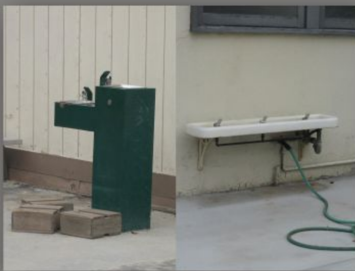
EXISTING NON-ADA COMPLIANT DRINKING FOUNTAINS