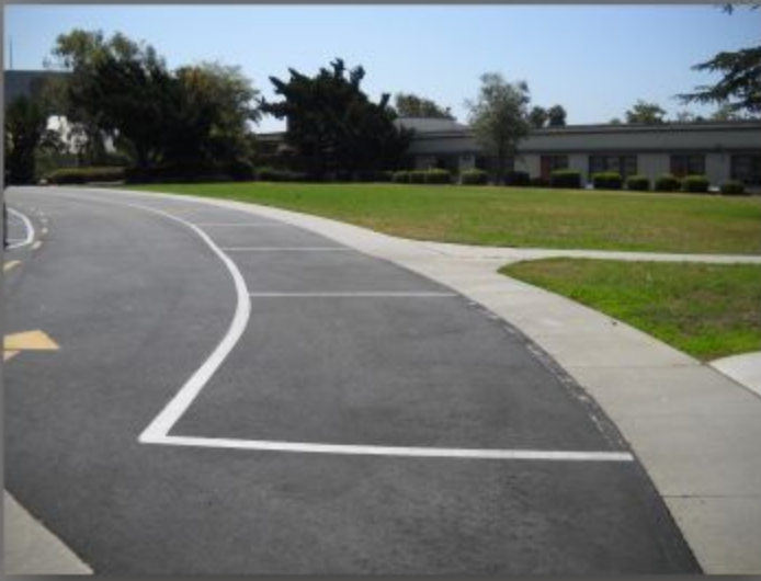
EXISTING PARKING AT SIDEWALK