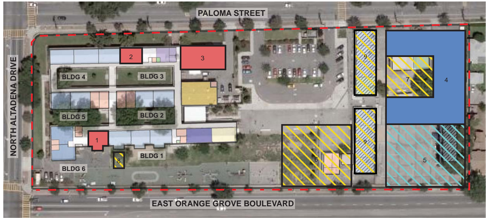
SITE SIZE : 5.30 ACRES